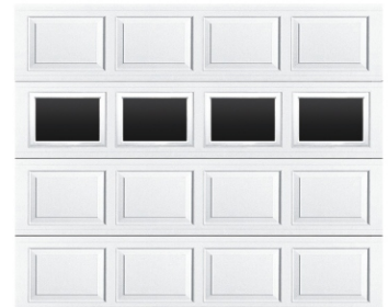
Short Panel windows

*The entire selection of decorative inserts from the Newport residential series is available for this model