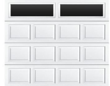
Long Panel windows