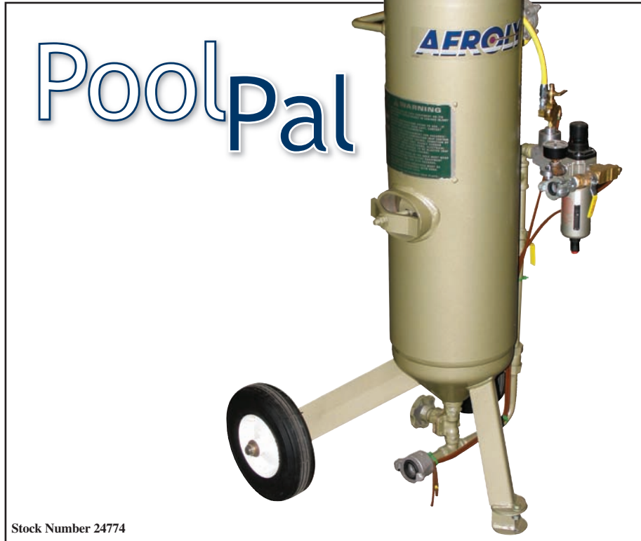
Stock Number 24774

The Aerolyte Pool Pal is a field-portable, light- to medium-duty blast machine ideal for the pool contractor for cleaning pool tile and other surfaces. Built to suit the busy contractor's needs: a one-cubic-foot model, 1042PP comes with a 1/8-inch orifice blast nozzle, which consumes as little as 17 cfm (cubic feet per minute) of compressed air. The Pool Pal is designed for all types of lightweight, fine-mesh media, making it suitable for other blast jobs where lightweight, fine-mesh media or abrasives are used.