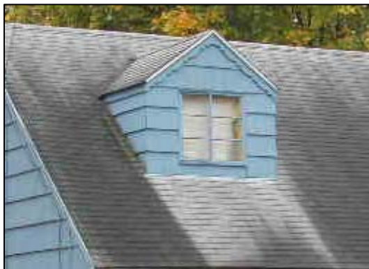
Extensive algae growth.