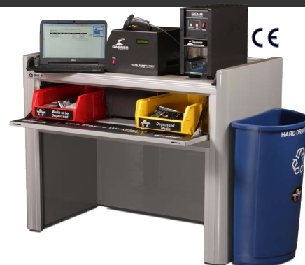
Complete Degauss Destroy Recycle Workstation DDR-34 with optional SCAN-1 (laptop not included)