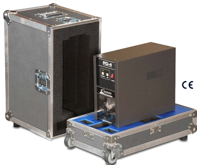
PD-4 in MIL SPEC transport case