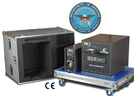
Mobility Package DDM-14

Configure a system to match your needs. Our optional MIL-SPEC transport case with built-in wheels makes it easy to transport the PD-4 to offsite data locations. To ensure data can never be retrieved, pair the PD-4 with our NSA/CSS EPL-listed TS-1 degausser, feature-filled HD-3WXL degausser, or budget-friendly HD-2 degausser.