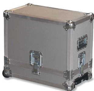
CASE-PD4 MIL SPEC Transport case