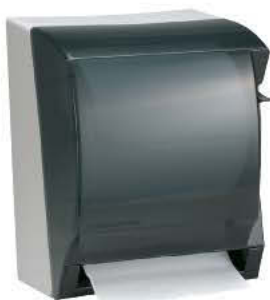
Universal dispenser. B