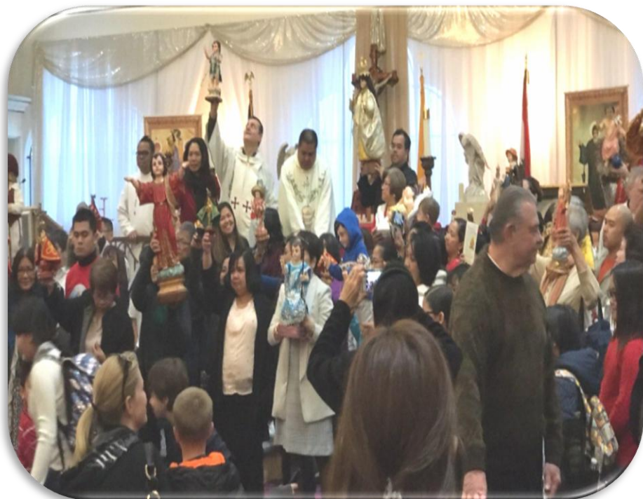
Santo Niño Celebration January 22, 2019