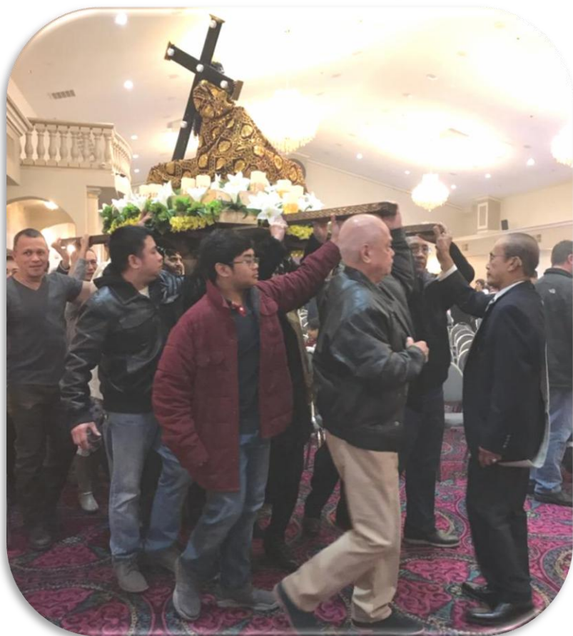
Black Nazarene Celebration January 5, 2019