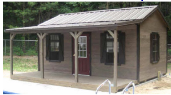
Fold Down Porch $17 a Sq Ft