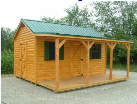
Outback Log Cabin