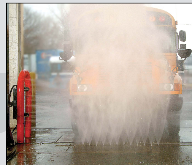
Photo-eyes at the entrance of the wash bay activate the powerful Rocker Blasters and under-chassis components to first clean any debris from the undercarriage of the vehicle.

Options for wash packages include: waxes, rust inhibitors, undercarriage washing and insect solvents. With the addition of our optional POS system, Vpass, you can turn your large vehicle wash into a well-managed profit center.