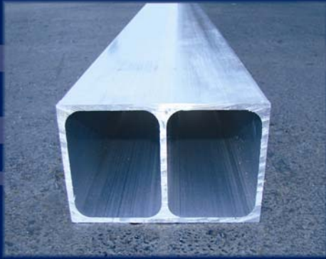
Fully-boxed aluminum I-Beam supports offer six-sided strength; while rounded inside corners eliminate stress points

Which means the 'backbone' of a Belanger transit wash is extremely durable, and able to withstand repeated operational stresses. What's more, it's compatible with all common wash chemicals – and corrosion resistant 'through and through,' unlike competitors' steel supports that use a galvanized surface coating.