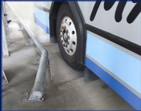
Galvanized guide rails use a 'rolling' design, preventing buses from climbing out, to keep the wash running smoothly