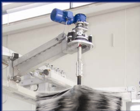
Patented socket joint on Gyro™ Wraps and single-hung brushes supports full brush weight, protecting motor & gearbox