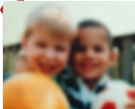
A scene as it might be viewed by a person with cataract.